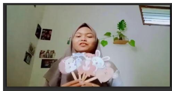
Figure 5. Using puppet as DST media

On the other hand, a student also used puppets as an alternative to digital illustrations, as shown in Figure 5 below.