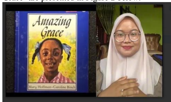
Figure 1. Digital Storytelling of Amazing Grace

The results of the storytelling of 'Amazing Grace' are presented in Figure 2 below: