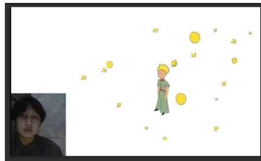
Figure 4. Example of DST display presentation

Furthermore, the storyteller must create visual aids to portray the story's characters effectively. As in Figure 4, the student prepared digital animation to ensure the audience comprehends the story. This step can be challenging, as demonstrated in Figure 4, where a student adapted the 'The Little Prince' novel into a 64-page digital storytelling format.