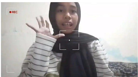
Figure 3: The third student's speaking video

This figure displays a snapshot from the first student's video, demonstrating their speaking performance after using the application. It highlights their progress and showcases how the tool has enhanced their speaking skills in a practical setting.