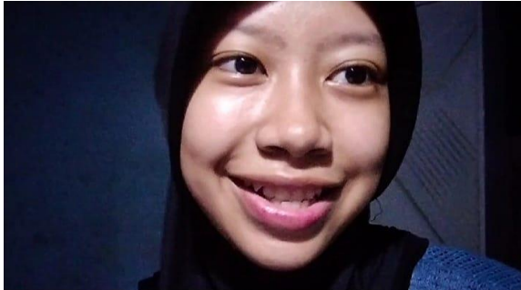
Figure 1. Visualization of application results

enjoyable content, combined with interactive features, can create a more dynamic and effective learning environment, ultimately improving educational outcomes for language learners.