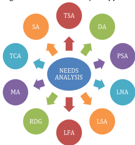
Figure 1. The needs analysis approaches

Each approach alone may not provide sufficient information, but collectively, they offer valuable insights for ESP instructors to understand their students' backgrounds, goals, and needs. Through collaborating and reviewing the main indicators of each needs analysis approach, the researcher concluded that Comprehensive Needs Analysis (CNA) is relevant to be implemented in this study. In this research CNA covers the learners' background, necessities, lacks, and wants including the learners' needs such as context, content, activities, and technology (Barghamadi, 2021)