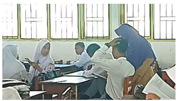
Picture 5. Proximity interference Another strategy that teacher applied is touch

The next strategy is proximity interference. When students misbehaved, teacher tended to use proximity interference by getting close and approaching them. The teacher closed the distance between herself and the students who acted disruptively. Some students behaved when the teacher addressed their disruptive behavior, but when the teacher walked away, they tended to repeat their behavior again.