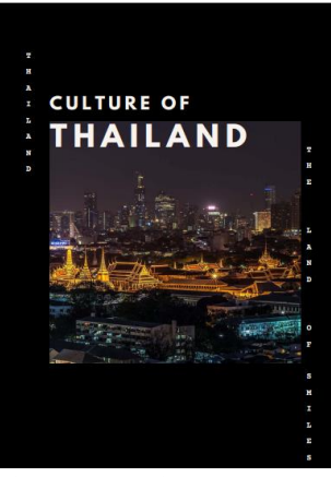
Figure 2. Sub cover review of Thailand, featuring nighttime vistas of the Thai royal palace and cityscape