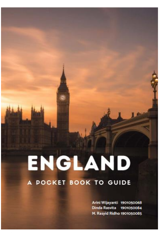
Figure 3. England sub cover review with an evening image of Big Ben London clock tower in UK Thames