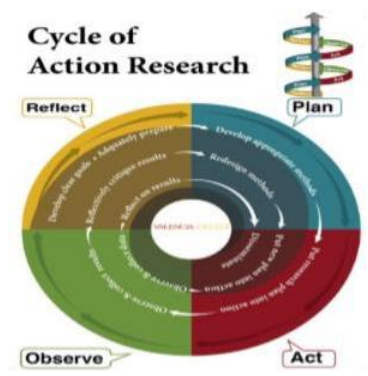
Figure 3. Cycle of action research (Adopted from Kemmis et al., 2014 in Yanto et al., 2020).

teaching for students in accounting program. The second author conducted data collection. Meanwhile, the third author was tasked with designing the research instrument. All authors collaboratively analysed the data and wrote the research report.