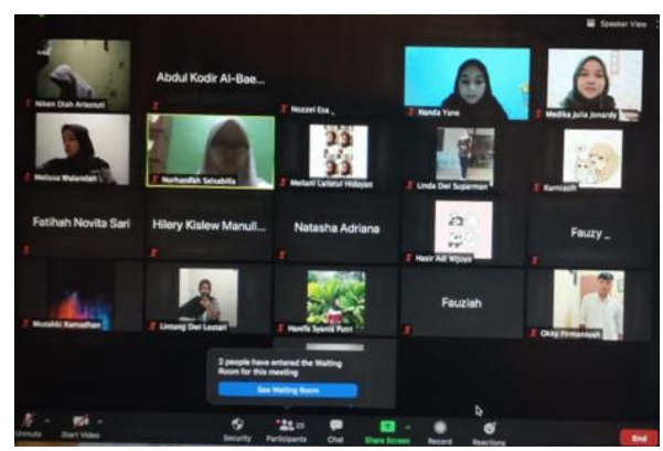
Figure 6. Students are presenting their topic in front of the classroom (Zoom Meeting)

From the two students' explanations, the flipped classroom learning model indicated that it made them independent and active in learning ESP. There were many opportunities for independent learning through videos on YouTube. The flipped classroom learning model indicated that the students to be more active in ESP learning. This can be seen in Figure 4, students could report the results of their independent learning in class. Lecturers and students discussed understanding of the learning materials which they have studied through videos on YouTube. Also, this activity could encourage students to report on the learning materials which they have been learned.