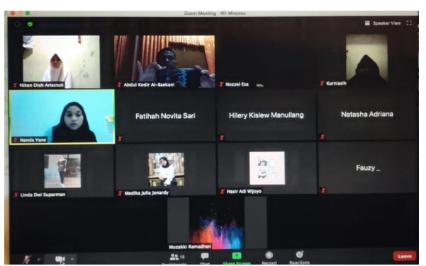
Figure 5. Activity in the classroom (Zoom Meeting) The followings are some students' explanations in using video material in learning ESP:

The data showed students' positive attitudes towards in using material in videos on YouTube in ESP learning. The students explained that the video material in ESP learning using the flipped classroom model was useful because they could study the learning material anywhere and at any time. They also though that the flipped classroom model was very easy to do and fun in learning ESP. (see figure 5).