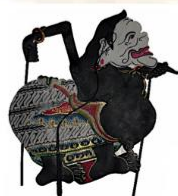
Figure 2 : Semar

In general, the characterization of this story is no different from other stories such as puppet stories where the characters consist of gods, humans (represented by Kings, Knights, folk), clowns and antagonists such as giants, other mystical creatures. The common thread between stories is also formed, there are times when the Gods descend into the world disguised as humans, giving teachings to the Kings, Knights or humans in general, also the ambitions of the antagonists to confront humans and gods. For example Semar character, Semar is one of the protagonists in the puppet world. He served the Pandawa, as a Punakawan, Semar is always asked by the Pandawa. He served as well as an "elder" for the Pandawa, protector and advisors. Actually the figure of Semar is a "god" means God, Semar is actually Sanghyang Ismaya, son of Sanghyang Tunggal and he is the brother of Batara Guru Kahyangan. Semar (Sanghyang Ismaya) is a representation of the upper world and the underworld, he became a paradox when he has to unite between the role of God and his humanitarian duties as a cleric / pawongan so he represented himself as an ordinary people.