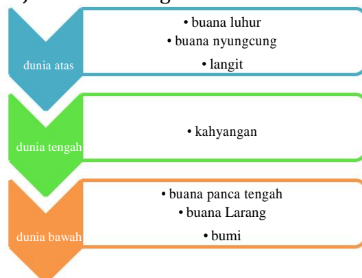
Figure 1. The Three Patterns of Paradox Aesthetics