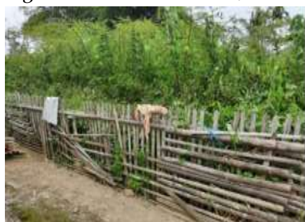
Figure 2. Land boundaries/marks along with SPPT-PBB

The community is convinced that there is no need to register land anymore because it is enough with proof of ownership which they consider a strong legal force in the ownership of their land rights. The following are images that the community considers strong evidence of land ownership: