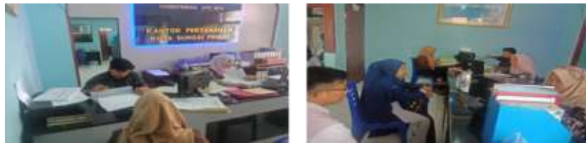
Figure 1. Land registration procedure service

Family Card, proof of payment of Land and Building Tax (PBB), letter sale and purchase (if the land is the result of buying and selling), current year's income tax (PPh) and other statements.